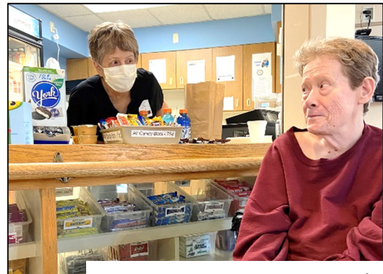
I FEEL LIKE THESE TWO ARE CONSPIRING!