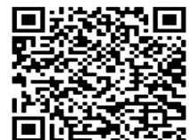
Scan for gravesite location