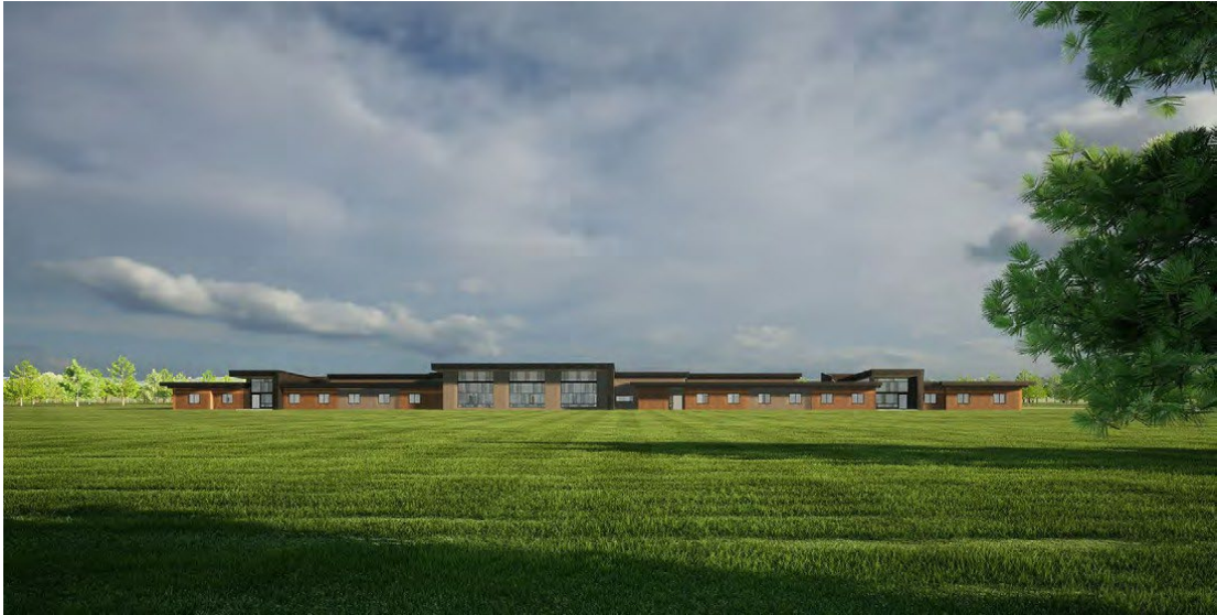
3D schematic view of proposed north addition