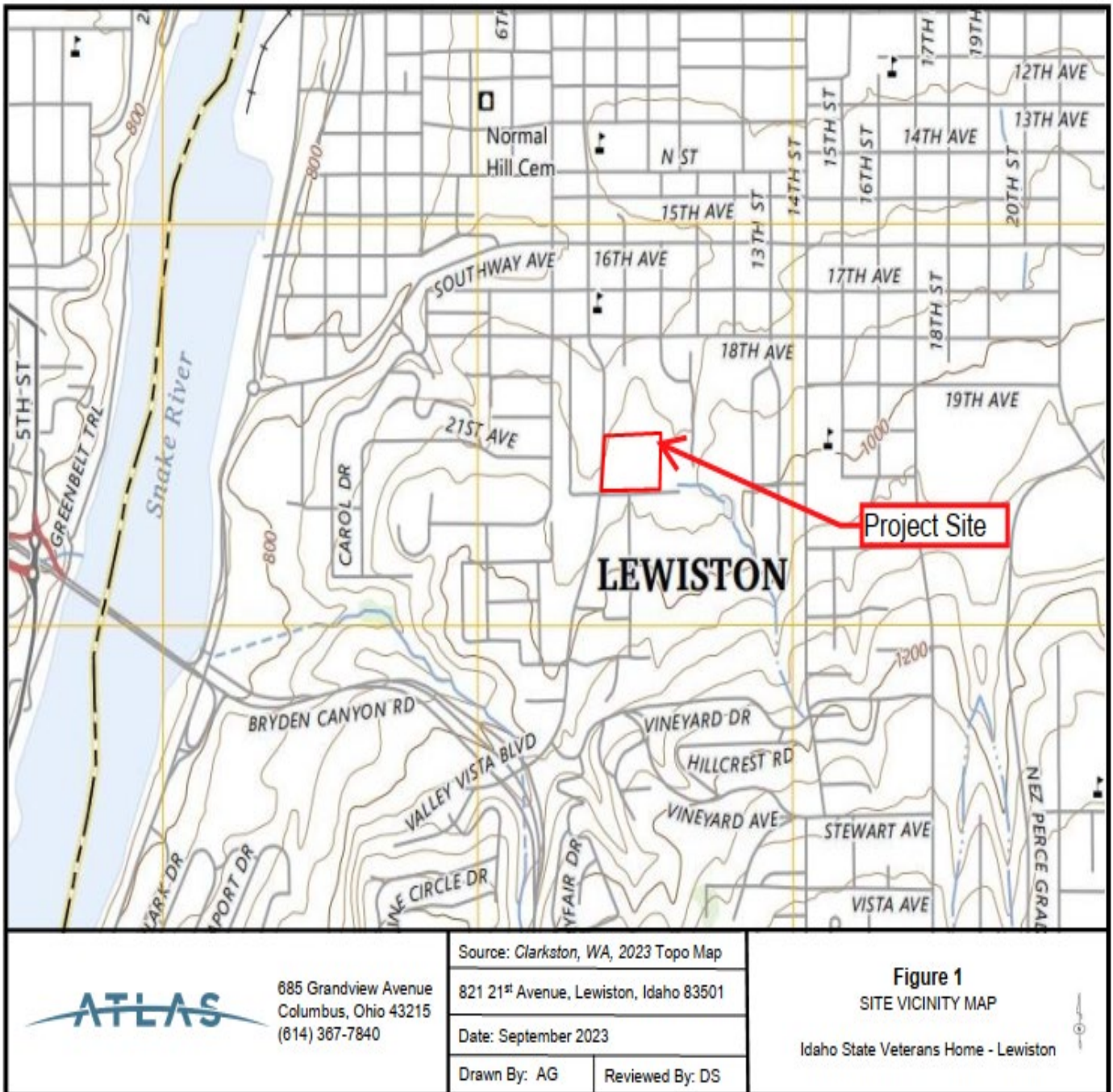
Figure 1. Site Vicinity Map

The decision to be made is whether—having considered the potential physical, environmental, cultural, and socioeconomic effects—VA should implement the Proposed Action including, as appropriate, measures to reduce adverse effects.