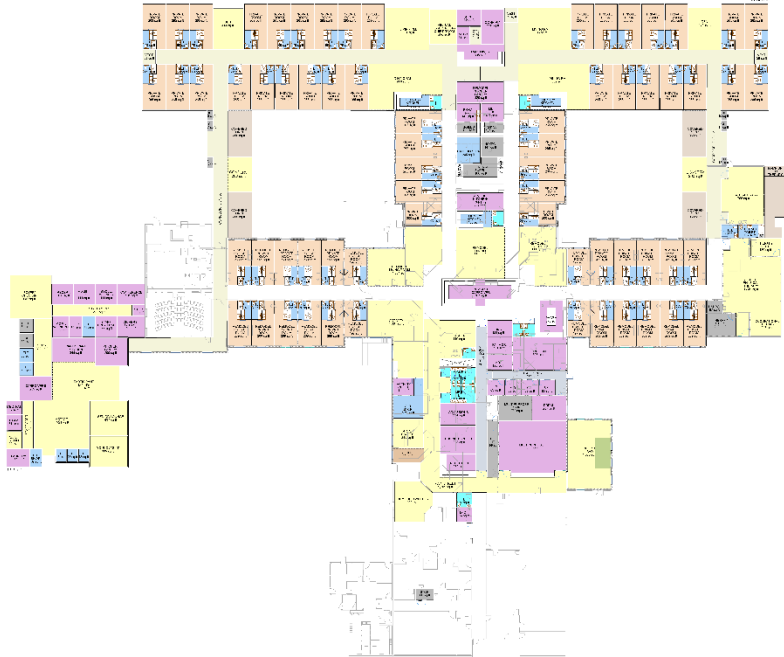
PROPOSED FLOOR PLAN NTS